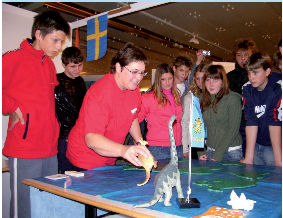
The Earth and Environmental Sciences Forum took the "Puzzle of the Earth" to the Slovenian Science Festival.