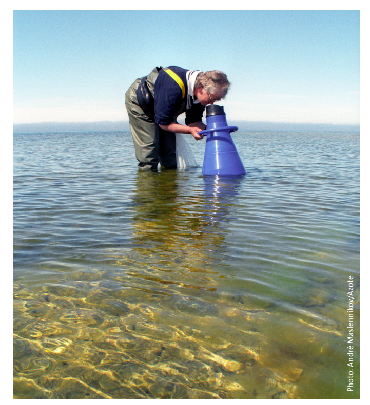
Greater transparency in the regulation of chemicals is needed.

To meet the current challenges regarding chemicals in everyday life, the structures for the control and gathering of chemical information under the legislation must be improved. One action that might improve the preconditions for using REACH to identify chemicals of concern for human health and the environment is to introduce significantly greater transparency in the registration process.