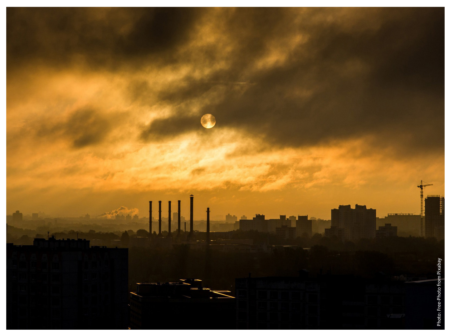
Identifying and managing chemicals of concern is a cornerstone of the REACH legislation. But there is a lack of compliance from the chemicals industry, and the information provided is often not sufficient for authorities to identify and prioritise the need for action.

In the REACH legislation, the chemical industry is responsible for assessing risks for human health and the environment for chemicals registered on the European market. The registration dossiers are sent to the European Chemicals Agency (ECHA) where only a small percentage per tonnage band is checked for compliance with the REACH legislation. Recently ECHA announced an increase in the number of dossiers it will check from 5% to 20%. Consequently, the majority of the registration dossiers will not be checked. According to the European Commission's own investigations, more than half of the dossiers that were checked turned out to be non-compliant.